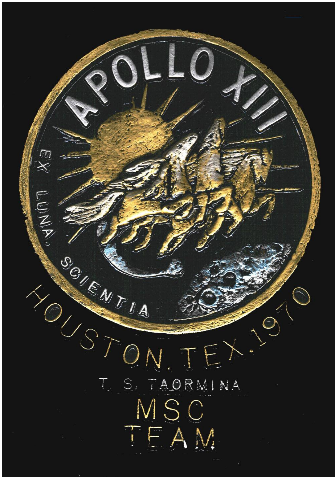
Plaques presented to members of the Mission Control Team during Project Apollo. MSC is Manned Spacecraft Center, which was the name until it was changed to Johnson Space Center