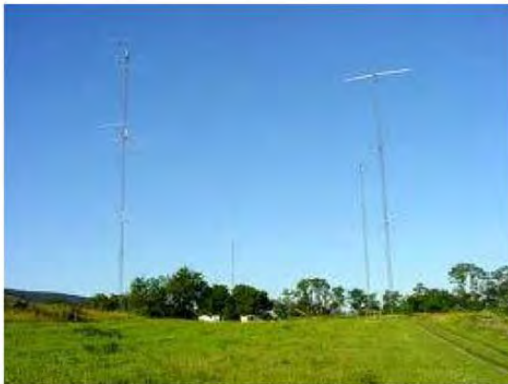
K3CR – near State College, PA