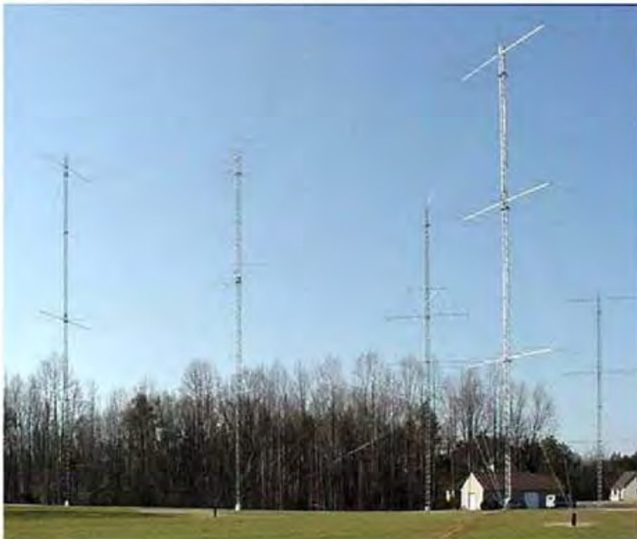
K4JA – Callao, VA