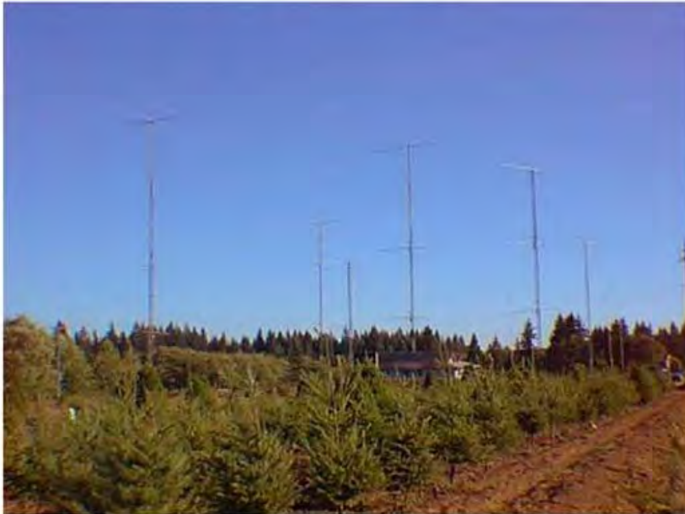
W7RM - La Center, WA