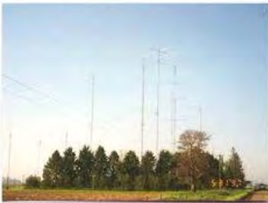
NØNI – Rippey, IA