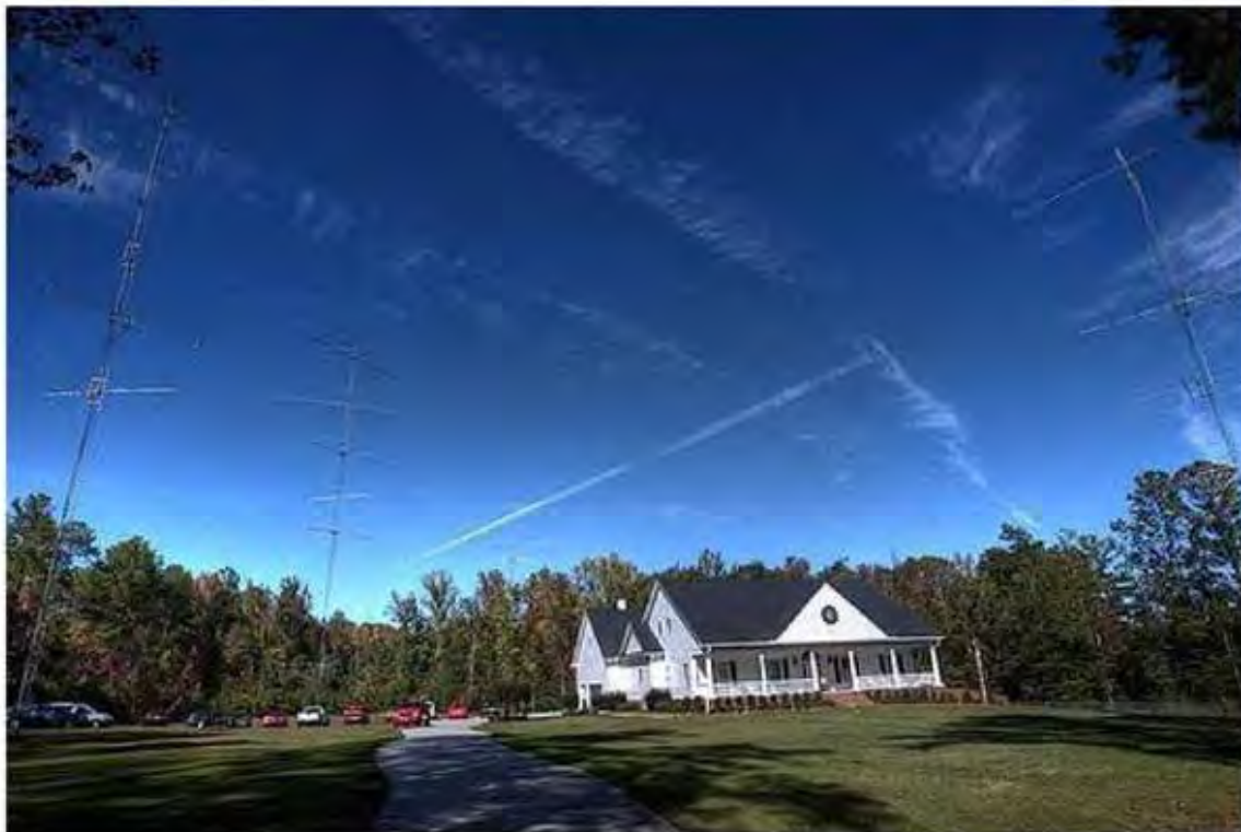
NQ4I – Griffin, GA