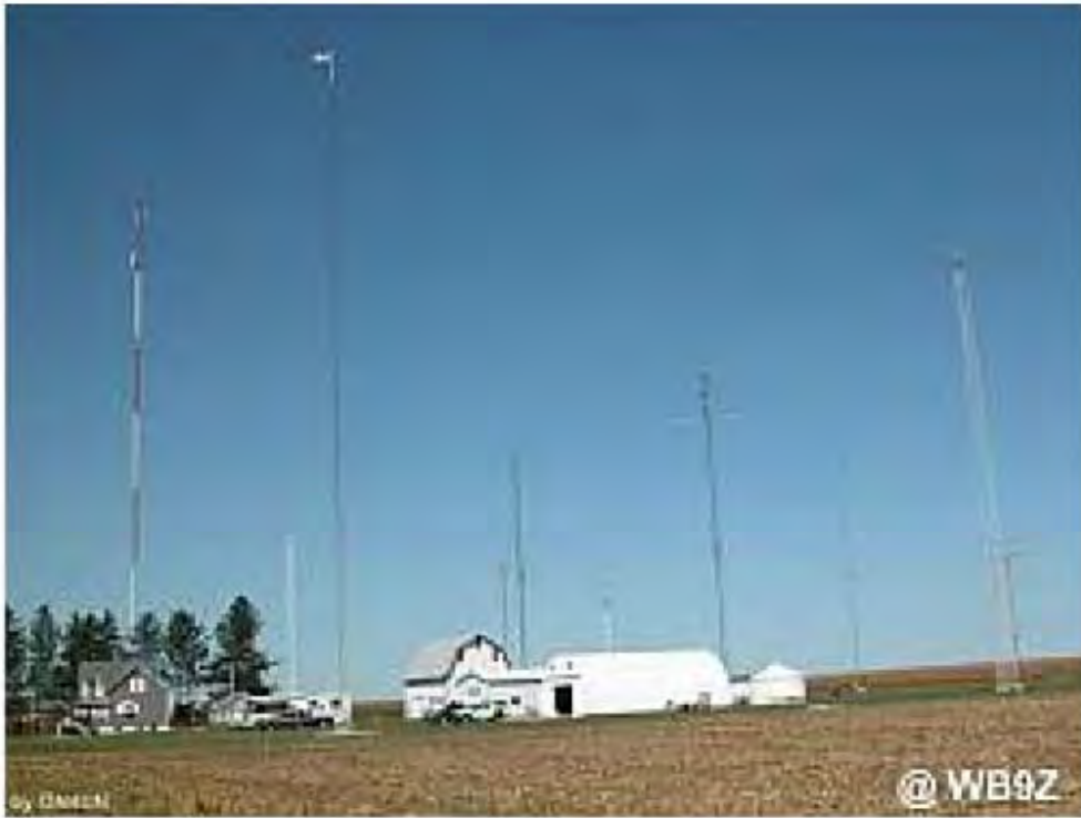
WB9Z - Crescent City, IL