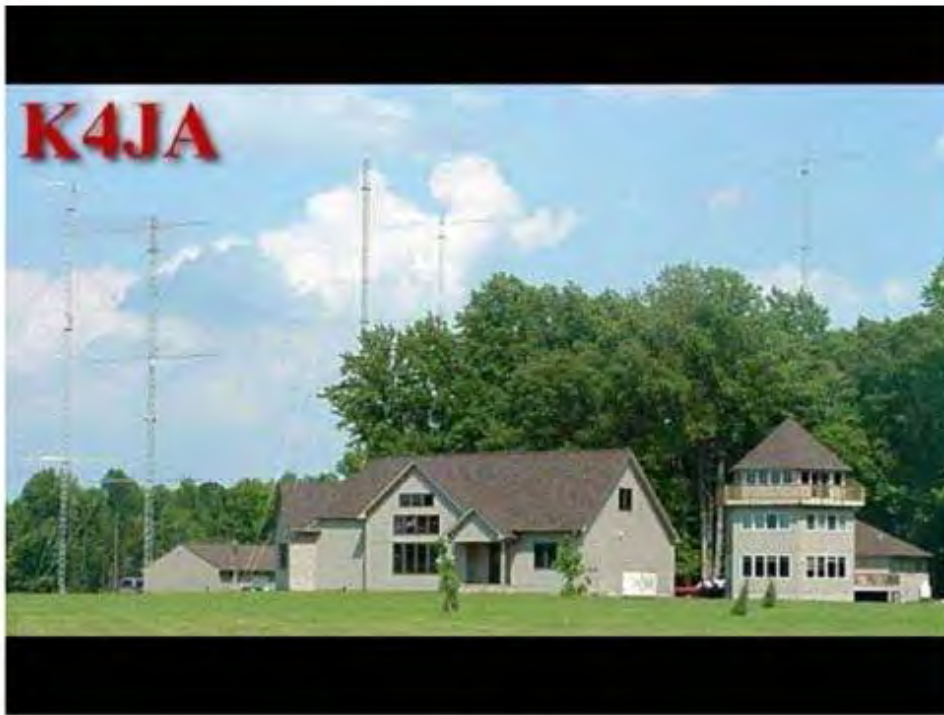
K4JA – Callao, VA