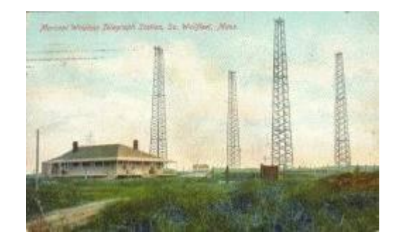
Figure 1- Marconi Wireless Telegraph Station, South Wellfleet, Mass.

Antenna systems, as mentioned above, are normally above the roof-line. They have been a part of American popular culture since the invention of radio.